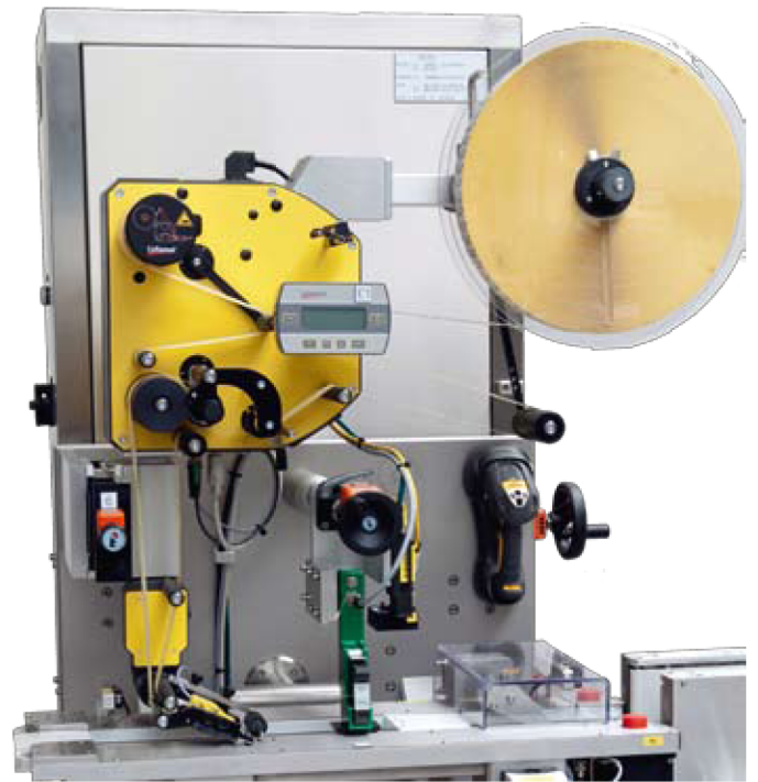
Collamat NG 50 X top labeling and sealing of pharmaceutical products. Nominal capacity 200 products per minute. Max. capacity 100'000 labels per hour