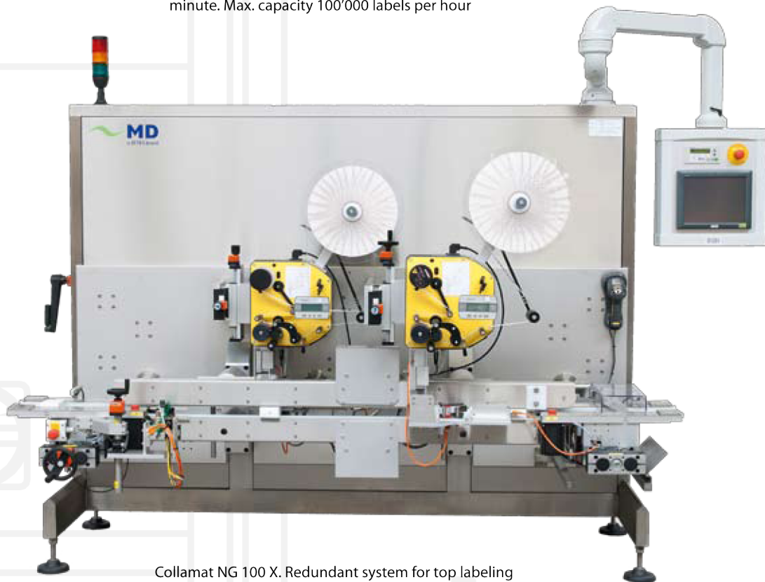
Collamat NG 100 X. Redundant system for top labeling with label inspection and print (Pharmaceutical solution). Labeling of pill packages. The system was built according to GMP standards