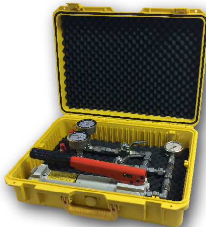
Sentry Test Pump